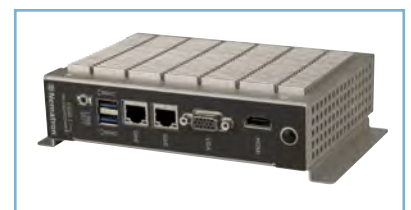
Wall or Shelf Mounting Brackets included with unit