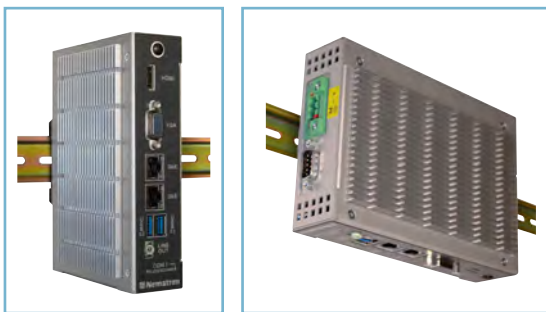
Back or Side DIN Rail Mount Configurations (adjustable Din Rail clip included)